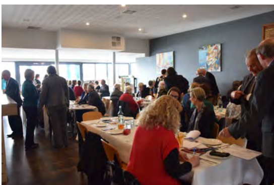
100 people attended the Albert Coates Lunch